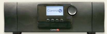
Media Controller — Ultimate home audio and home automation control.