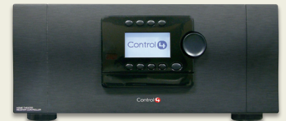
Home Theater Receiver Controller — Ultimate home theater and home automation control.